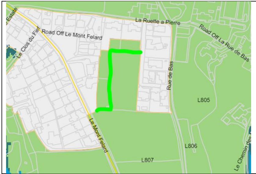
Plan 1: Le Pepiniere, St Lawrence