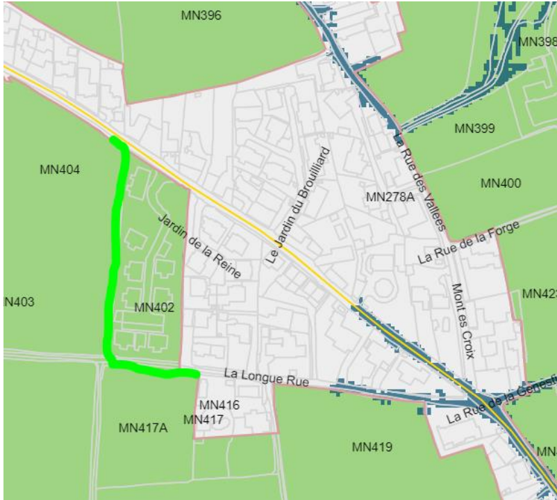
Plan 3: Field MN402, St Martin