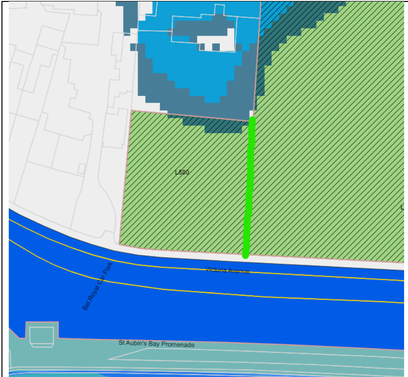
Plan 7: Midbay House (L880)