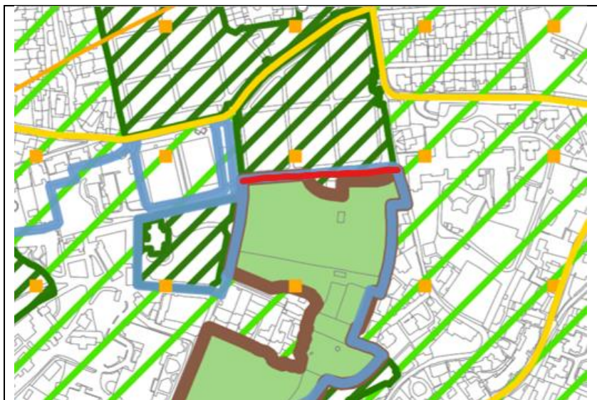
Plan 6: Land to the south of Mont à L'Abbé cemetery