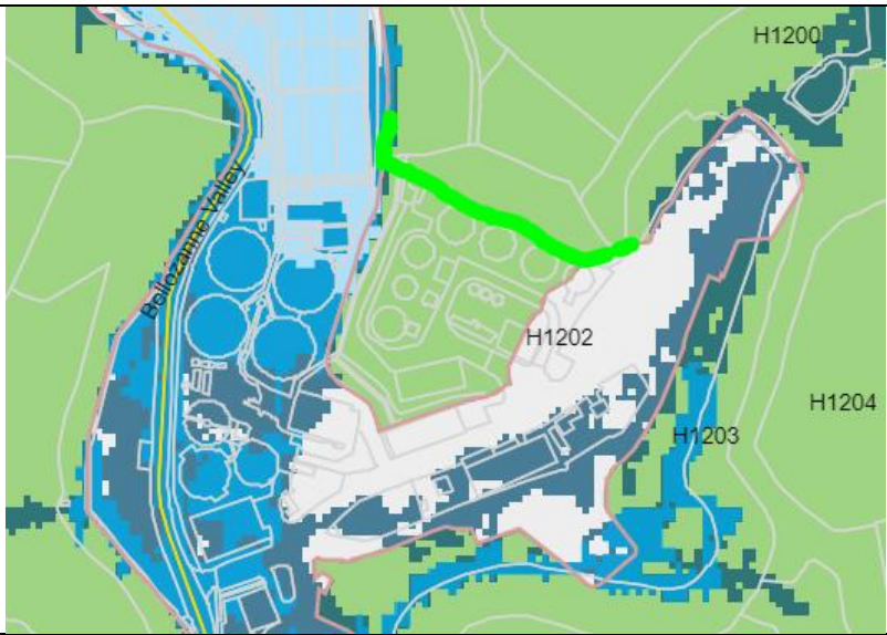
Plan 4: Sewage treatment plant, Bellozane, St Helier